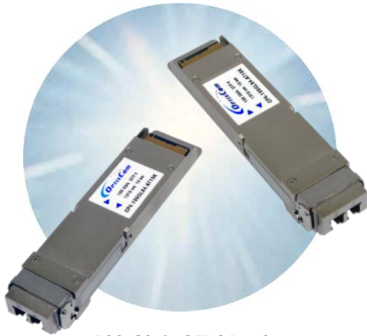
100 Gb/s CFP4 Package